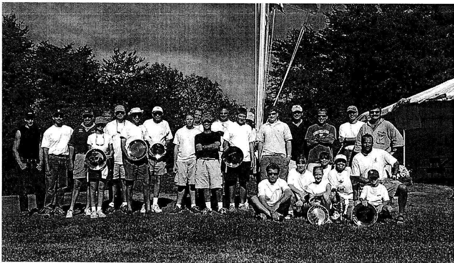
More than 25 CSC sailors competed in the Hospice Regatta at the Western Carolina Sailing Club in Anderson.