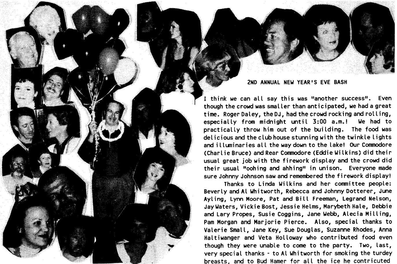
2ND ANNUAL NEW YEAR'S EVE BASH

Please remember that ALL profit ($300 for the New Year's Eve Party) goes back to the Club in one form or another. So, please support your Auxiliary!